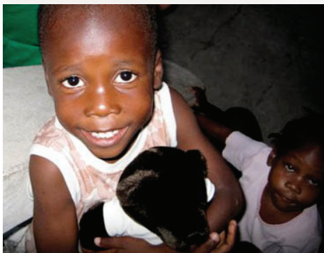
A Somebody Cares bear can bring a smile to a child's face even when they've just survived a disaster (above). Another bear brings comfort to children in India who are getting dental work done (top right).

To find out how you can send hope like this through the ministry of Somebody Cares please visit www.SomebodyCares.org .