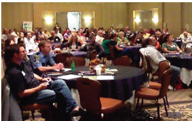
Boundless Mercy gave away Somebody Cares bears on Valentine's Day as a reminder of God's unfailing love (above right). Pastors and ministry leaders learn strategies in the fight against trafficking at a Somebody Cares Houston meeting (above).

This year Somebody Cares Houston hosted a pastors' and leaders' meeting to emphasize the important work of min-