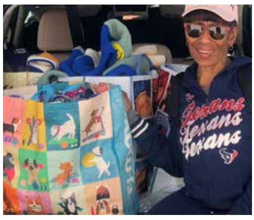
Equipping Houston area police departments for back-to-school and Christmas outreach to their communities.