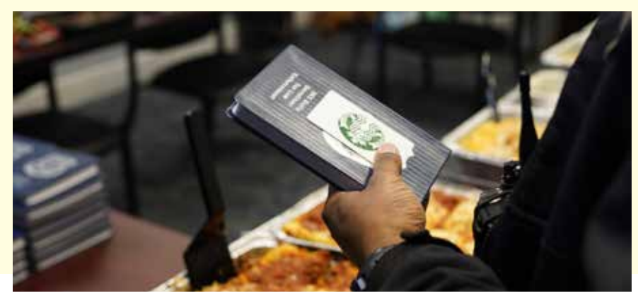
Somebody Cares partnered with Bridge Church Greenbrier in Virginia to honor the deputies of Chesapeake Police Precinct 5 with a catered meal, Behind the Badge devotionals, and Starbucks gift cards as a token of appreciation for their dedicated service.