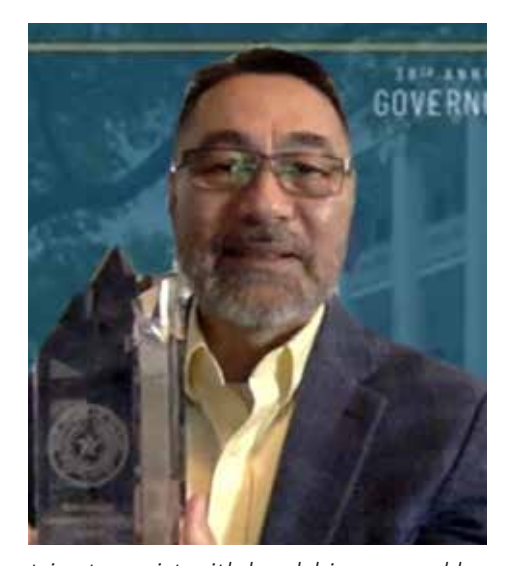
tries to assist with hardships caused by the pandemic."

"In the greater Houston area alone, SCA gave out $280,000 in funding as well as valuable in-kind gifts through dozens of partner churches and minis-