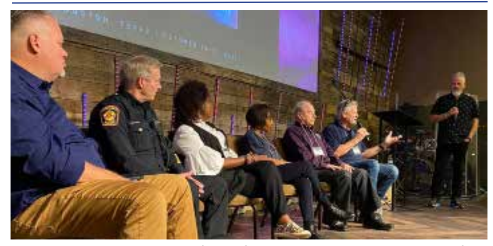
During our 2021 Summit, a panel of law enforcement and chaplains who are part of the SCA network discuss the importance of community engagement and lifting up all aspects of chaplaincy in prayer.